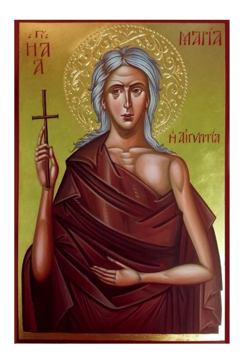
Sunday of St. Mary of Egypt April 21, 2024