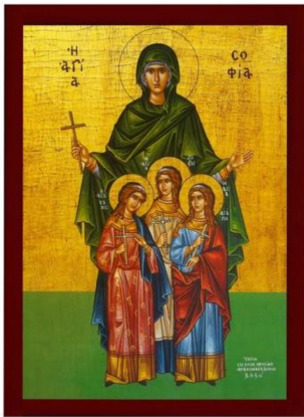
Martyr Sophia and her Three Daughters

The Holy Martyrs Saint Sophia and her daughters Faith, Hope, and Love were born in Italy. Their mother was a pious Christian widow who named her daughters for the three Christian virtues. Faith was twelve, Hope was ten, and Love was nine. Saint Sophia raised them in the love of the Lord Jesus Christ. Saint Sophia and her daughters did not hide their faith in Christ, but openly confessed it before everyone.