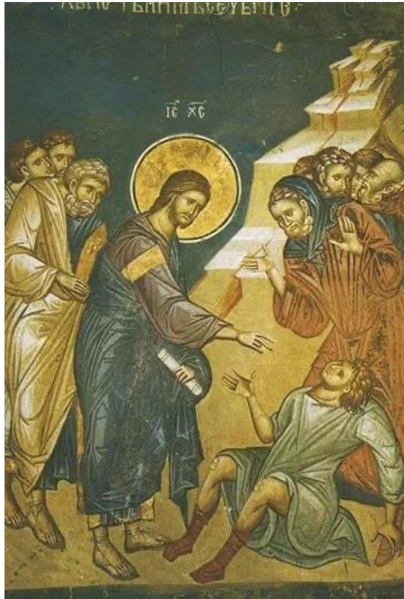
Christ Heals Demon-Possessed Boy